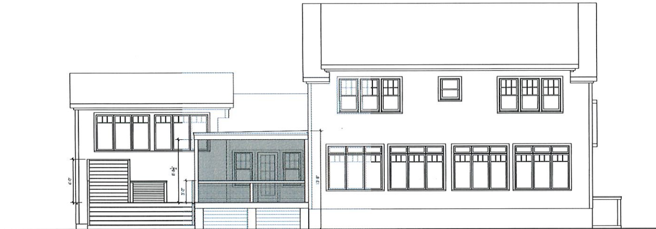
1 REAR ELEVATION A3 SCALE: 1/4" = 1'-0"

THIS SET OF ARCHITECTURAL DRAWINGS IS THE PROPERTY OF DAVITT ARCHITECTURE, P.C. IT IS TO BE USED ONLY FOR THE PROJECT AND SITE SPECIFICALLY IDENTIFIED HEREIN. ANY REUSE, REPRODUCTION, OR MODIFICATION OF THESE DRAWINGS WITHOUT THE WRITTEN CONSENT OF DAVITT ARCHITECTURE, P.C. IS STRICTLY PROHIBITED. THE USER OF THESE DRAWINGS SHALL BE RESPONSIBLE FOR OBTAINING ALL NECESSARY PERMITS AND REGULATORY APPROVALS. THE USER SHALL BE RESPONSIBLE FOR VERIFYING THE ACCURACY OF ALL INFORMATION PROVIDED TO DAVITT ARCHITECTURE, P.C. AND FOR OBTAINING ALL NECESSARY PROFESSIONAL SEALS AND LICENSES. THE USER SHALL BE RESPONSIBLE FOR OBTAINING ALL NECESSARY PROFESSIONAL SEALS AND LICENSES. THE USER SHALL BE RESPONSIBLE FOR OBTAINING ALL NECESSARY PROFESSIONAL SEALS AND LICENSES.